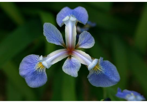
Blue Flag ( Iris versicolor )

" To him whose elastic and vigorous thought keeps pace with the sun, the day is a perpetual morning."